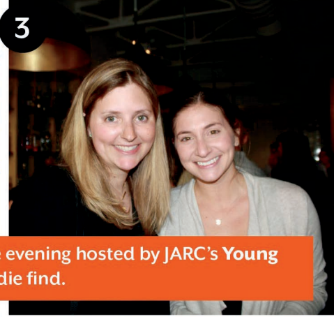
Food, fun and fellowship were on the itinerary for an intimate evening hosted by JARC's Young Adult Committee at Voyager, Ferndale's newest seafood foodie find.