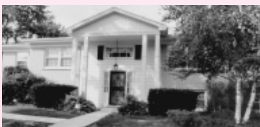
NATALIE AND MANNY CHARACH HOME FARMINGTON HILLS Funded in part by the Natalie and Manny Charach Permanent Operations Fund