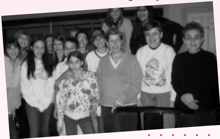
Temple Kol Ami Family Religious School Invites JARC to a Hanukkah Bowling Party