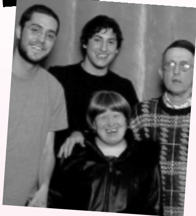
Temple Israel Youth Federation's Annual Hanukkah Dance Party