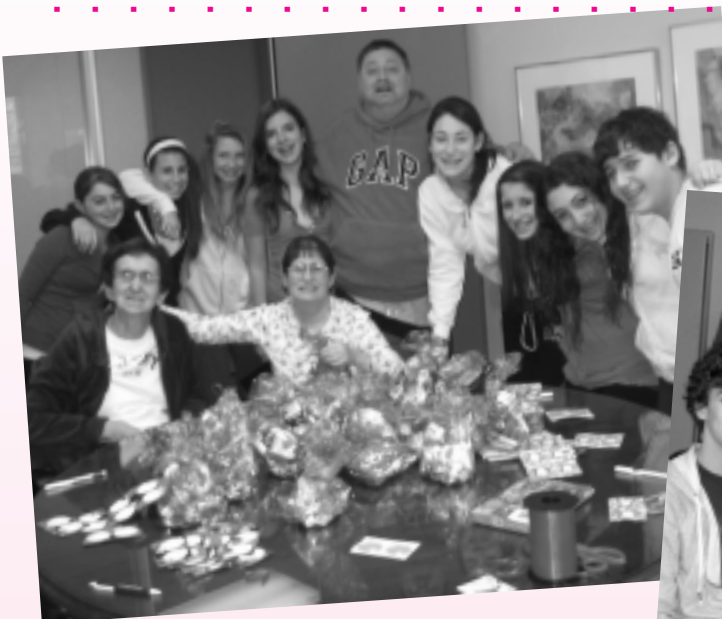
"Heart to Heart" Social Action Project with Teen Volunteers