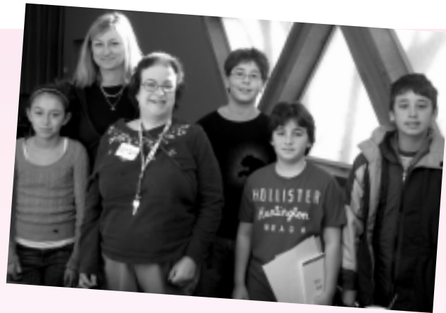
6th Grade Community Tzedakah Experience