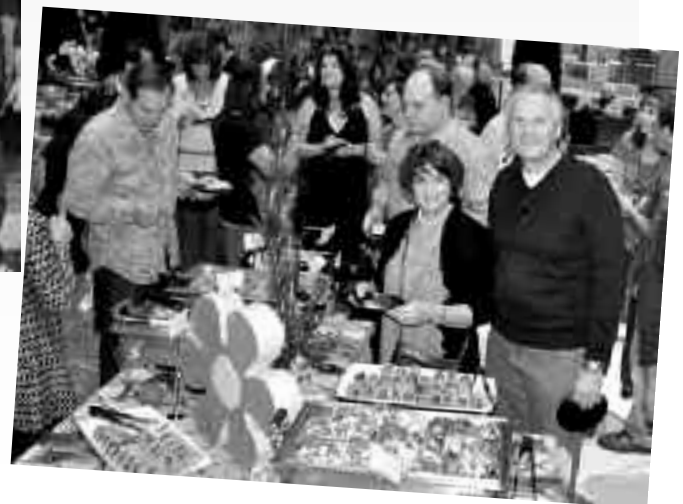
Right: Guests enjoying a delicious spread