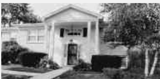
NATALIE AND MANNY CHARACH HOME FARMINGTON HILLS Funded in part by the Natalie and Manny Charach Permanent Operations Fund