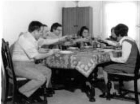
Shabbat dinner at JARC's first Haverim Home

In the mid-1960s, a group of parents met at the Detroit Jewish Community Center while their adult children with developmental disabilities gathered for a social program. Over coffee, the parents shared a number of concerns about the well-being of their children.