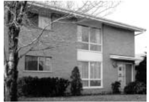
The first JARC home on Evergreen in Detroit, 1972

Eventually, PAJRC garnered the help of other community agencies and began a campaign to raise funds for a residence. After netting $250,000, the group tried to buy a house in West Bloomfield and have it rezoned for a group home, but they were turned down by the community. In 1971, United Jewish Charities contacted PAJRC and offered to rent out a vacant converted duplex on Evergreen in Detroit that was formerly used as a temporary home for children and young adults.