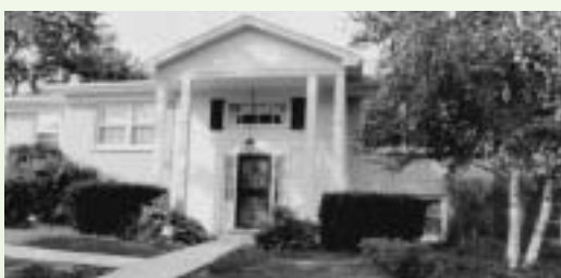
NATALIE AND MANNY CHARACH HOME FARMINGTON HILLS Funded in part by the Natalie and Manny Charach Permanent Operations Fund